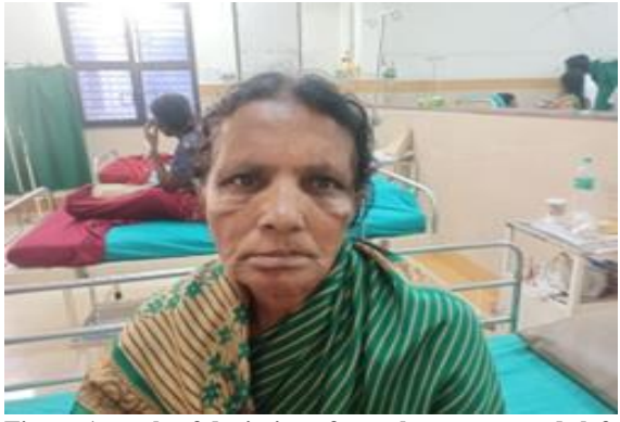
Figure 1: angle of deviation of mouth more towards left side and loss of wrinkling of forehead on both sides

The patient showed gradual improvement and was discharged with tapering dose of oral steroids on the seventh day of admission with plans for outpatient follow-up. This case highlights the complex interplay of medical conditions and bee sting-related complications with the importance of a thorough diagnostic and treatment approach.